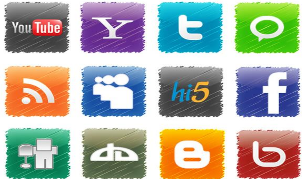
12 social media icons in two sizes - 128x128 , 64x64